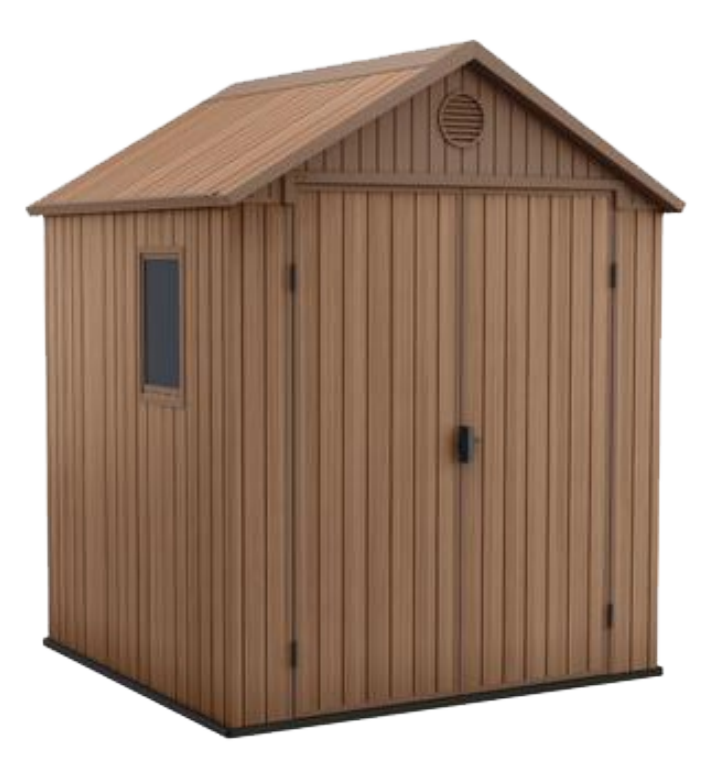
Keter® Darwin 6 x 6 Outdoor Resin Storage Shed Actual Size: 6' 2-13/16" x 6' x 7'3"

Model Number: 17197898 | Menards ® SKU: 1932625